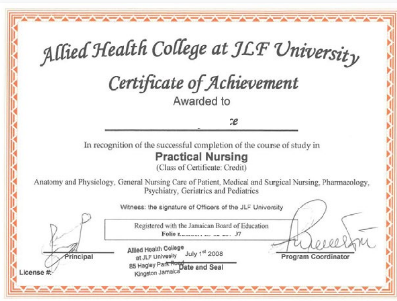
Figure 4: Practical Nursing Certificate from JLF University Allied Health College, which was prosecuted in the state of Florida in 2011

Figure 4 above shows a practical nursing certificate from Allied Health College at JLF University. JLF University, which has affiliated locations in Florida, Haiti and Jamaica, was sued by Florida Attorney General Pam Bondi for defrauding students in 2011. The following year, the university and its affiliates were required to pay $469,000 in restitution and an additional $67,000 in civil penalties 7 . The institution's website and the transcript for the above qualification together claim accreditation by Accrediting Commission International (ACI), the Association of Distance Learning Programs (ADLP), and the United States Distance Learning Association (USDLA). However, all three entities are accreditation mills.